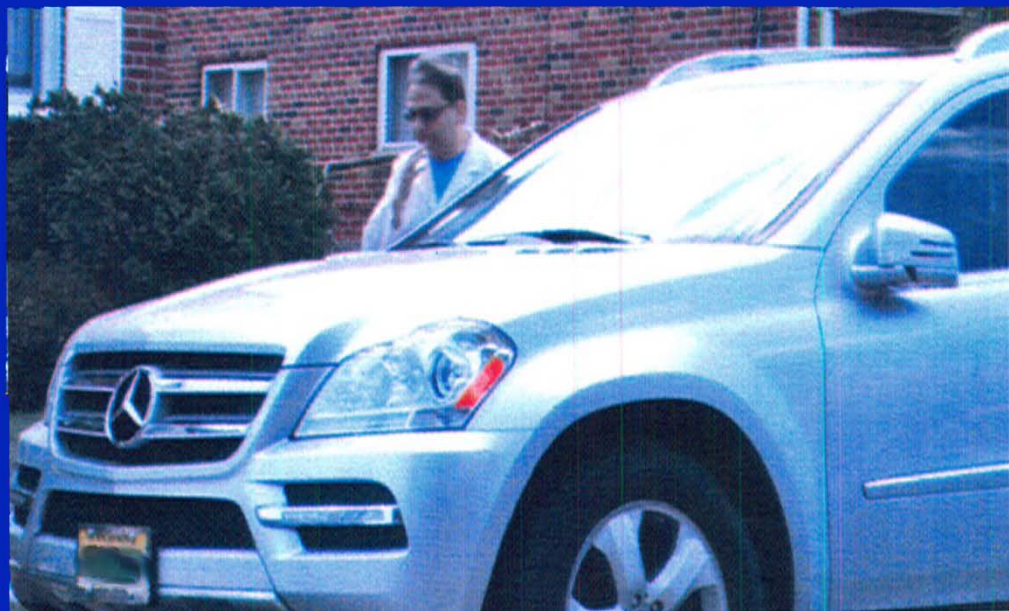
22 Lyle Place Edison, New Jersey