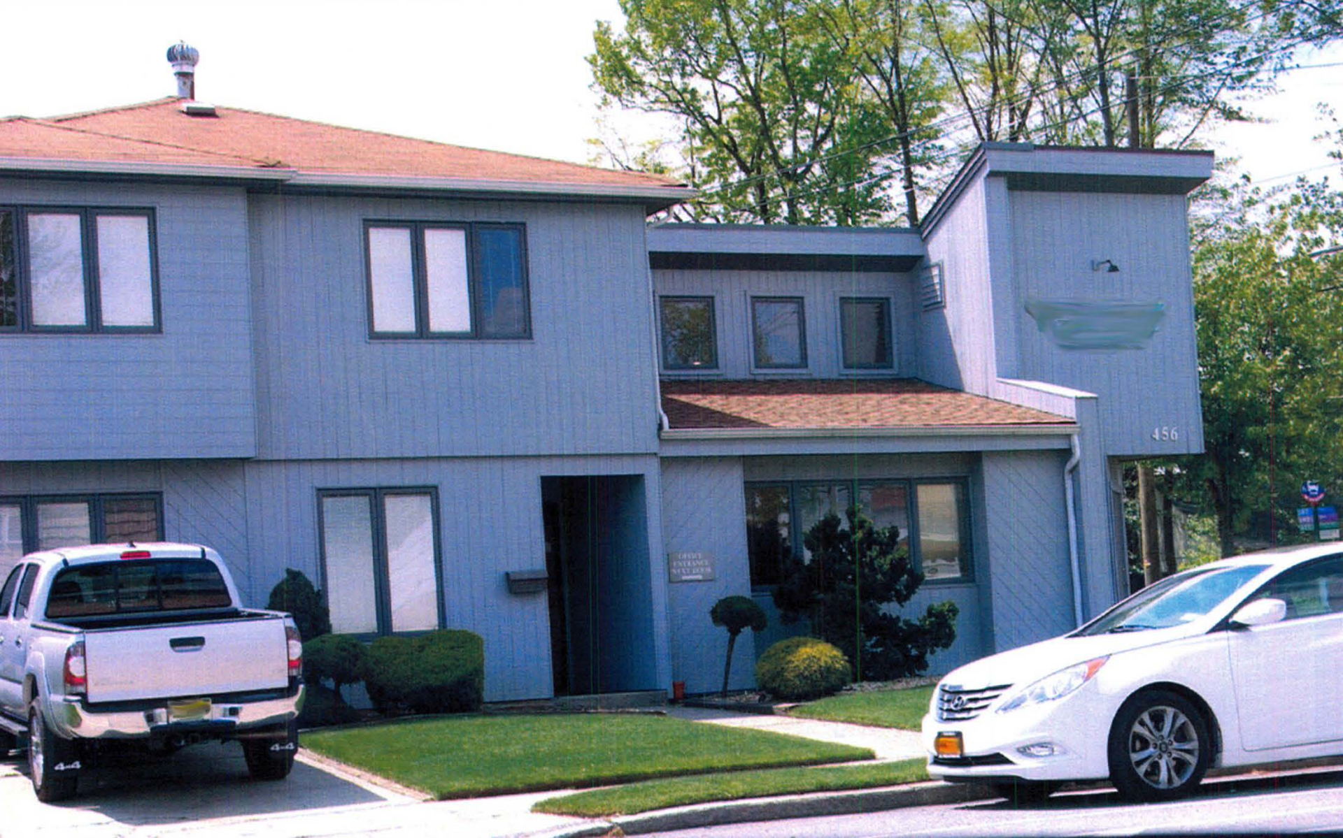
456 Arlene Street Staten Island, New York