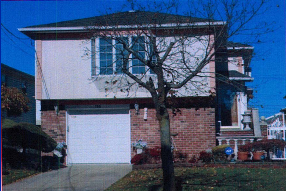
759 Katan Avenue Staten Island, New York