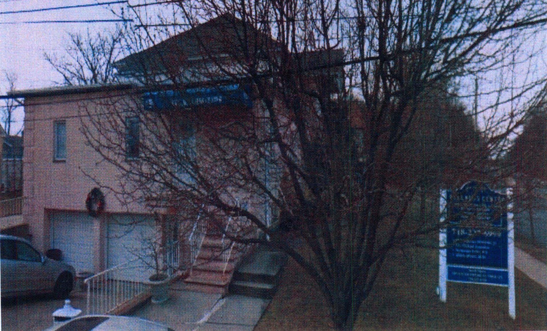
NYC Wellness Center 4870 Hylan Blvd. Staten Island, New York