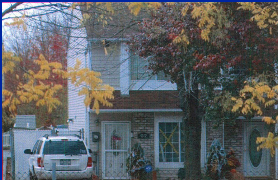
92 Fahy Avenue Staten Island, New York